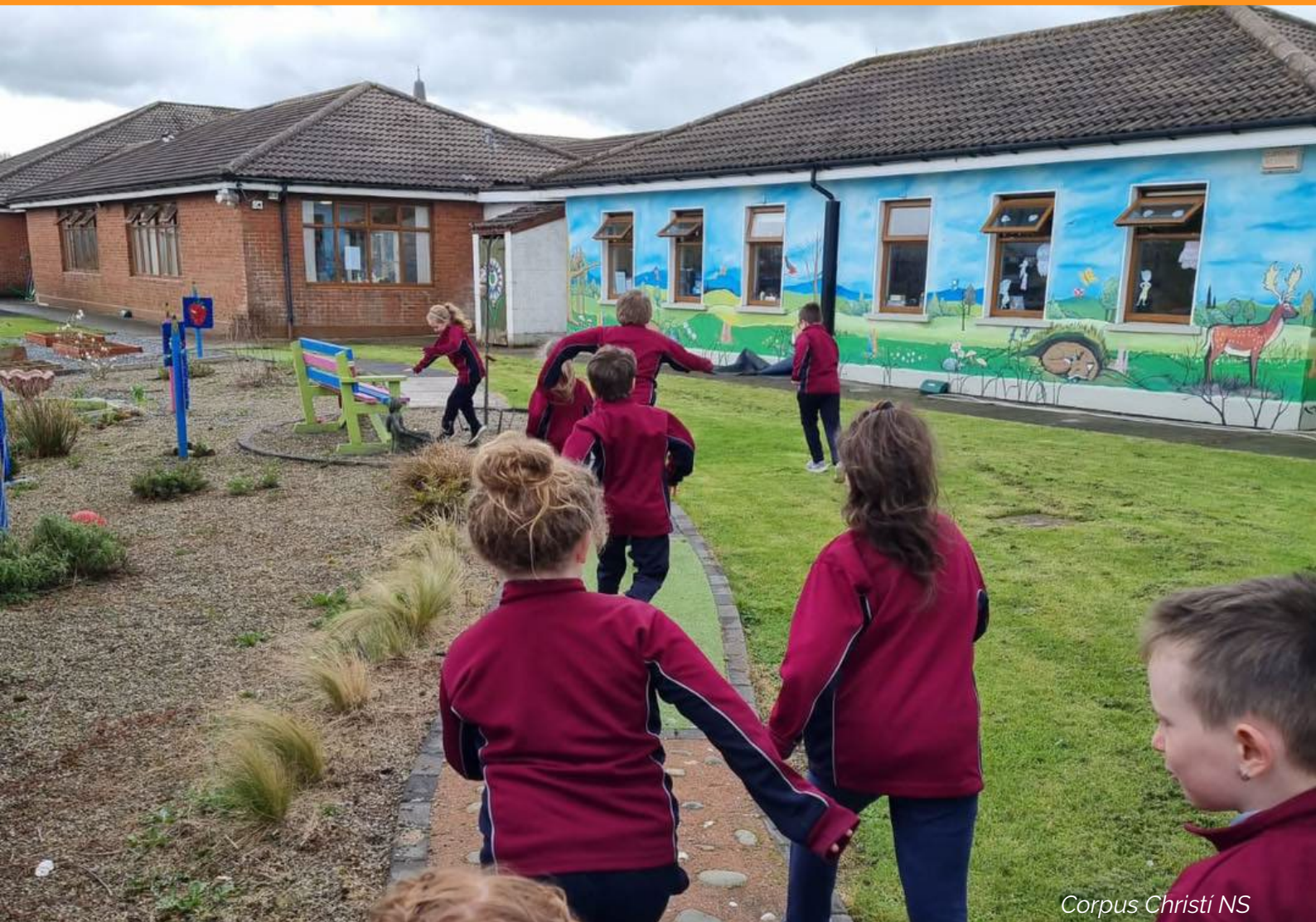
Corpus Christi NS

Entry Guidelines – Deadline June 8 th , 2024